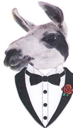
After signing his donor card