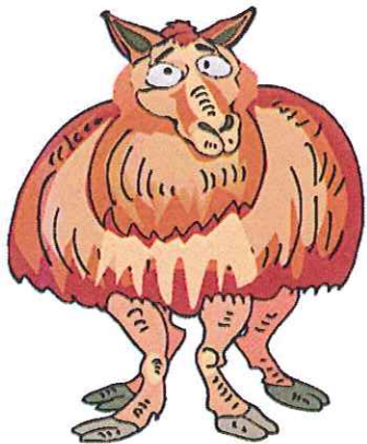
Before signing his donor card

When things look hopeless or desperate and lives are on the line, who better to call upon than 007? Be here in Fairplay when our intrepid hero steps forward to fearlessly face the challenges of the Llama Rama -3 miles of arduous terrain, rushing river crossing and the dreaded Heartbreak Hill. Join the team of those who are "Licensed to Give." Throw caution to the wind and run with the llamas. This is guaranteed to be a Bonding experience!